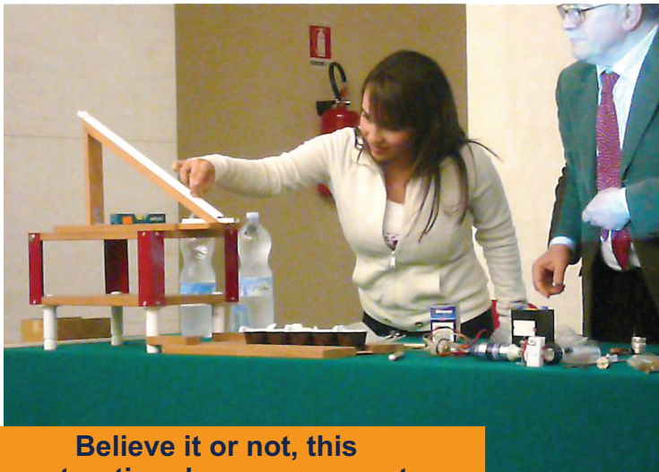
Believe it or not, this contraption does square roots of numbers, using only gravity

Pietro Cerreta Associazione ScienzaViva, Centro della Scienza Calitri - Italy